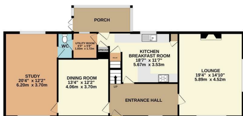
GROUND FLOOR 1128 sq.ft. (104.8 sq.m.) approx.